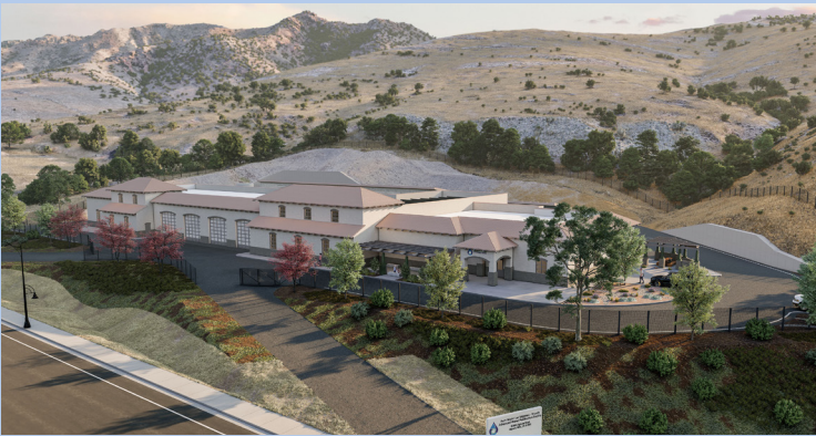
A rendering of the proposed AWPF on Agoura Road.

The Las Virgenes-Triunfo Joint Powers Authority (JPA) has reached the second stage of the procurement process for construction of a new Advanced Water Purification Facility (AWPF) and Reverse Osmosis Concentrate (ROC) Pipeline. Following the release of a Request for Qualifications for interested design-build firms in April, the JPA began procurement by comparing qualifications of the prospective teams relative to the needs of the Project and established a shortlist of the most qualified firms. The JPA's nine-member selection committee reviewed Statements of Qualifications received from seven firms and announced the top three. Those three firms were recently invited to submit a proposal, and it is expected that an award will be made in February 2024 at which time design efforts will commence. Construction of the estimated $364 million Pure Water Project Las Virgenes – Triunfo is scheduled to start in late 2025 and will be operational prior to the 2030 regulatory deadline. The advanced treatment of reclaimed wastewater to drinking water standards will eventually supply up to 30% of drinking water for Las Virgenes Municipal Water District and Triunfo Water and Sanitation District customers.