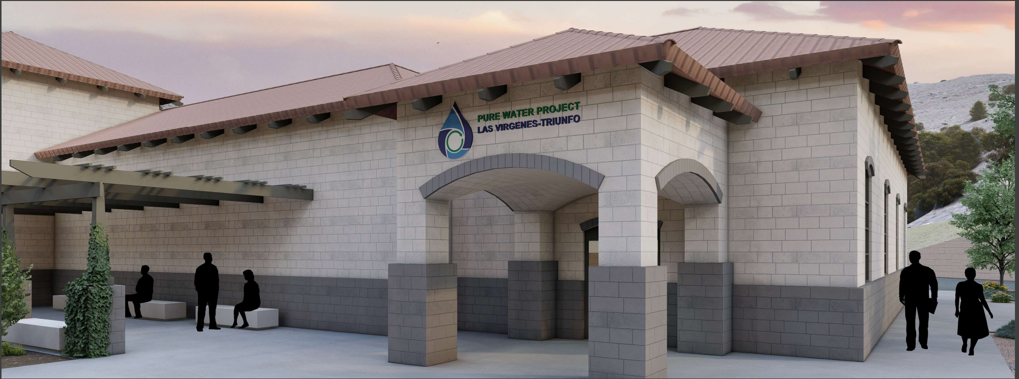
AWPF at Agoura Road Site