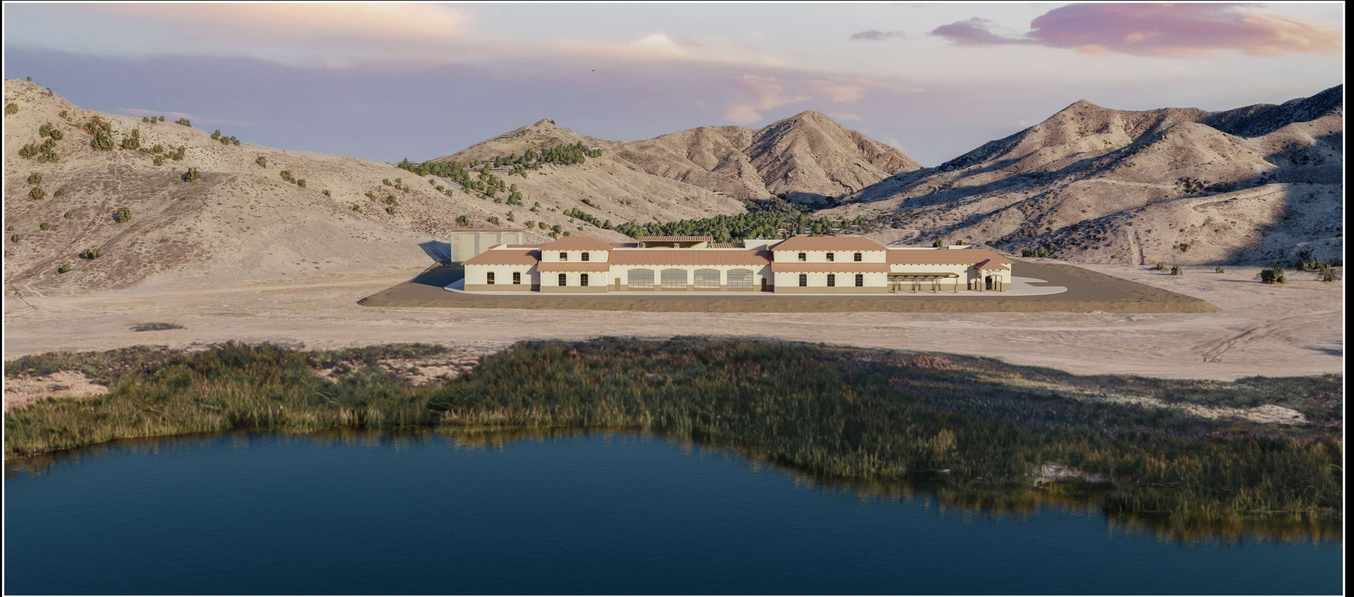
AWPF at Reservoir Site