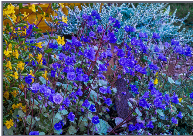
Desert Bells Phacelia campanularia

Phacelia campanularia (Desert Bells), annual, 1 foot to 18 inches tall and wide, with oval to rounded, toothed, green to blue-green leaves. Bright blue flowers in one-sided coiled clusters uncurl as the flowers open in sequence in late winter or spring. Native to open, sandy or rocky places in deserts of southern California. Self-sows. Sun or part shade, well-drained soils. Needs moisture in spring to bloom well.