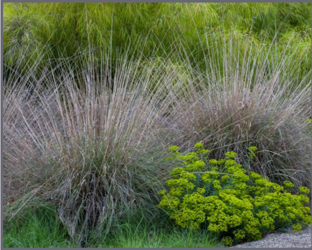
Pine Muhly Muhlenbergia dubia

Muhlenbergia dubia (Pine Muhly), warm-season bunchgrass, 1-2 feet tall and 2 feet wide, with fine-textured, bright green leaves and tall plumes of purple-tinged, creamy white flowers in late summer and fall. Self-sows but not aggressively. Native to desert mountains from Arizona to southwestern Texas and northern Mexico. Sun to light shade, fast drainage, good air circulation.