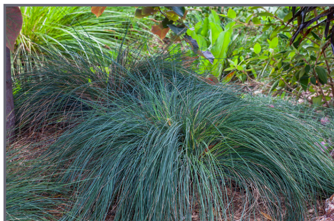
Dwarf Mat Rush Lomandra longifolia 'Breeze'

Lomandra longifolia 'Breeze' (Dwarf Mat Rush), perennial, clump forming, 2-3 feet tall and wide, with grasslike, bright green leaves and flowering stems, usually shorter than the leaves, bearing clusters of tiny, whitish yellow, spring or summer flowers with noticeably bristly bracts. Compact selection of a species native to varied habitats in eastern Australia. Sun to part shade, most soils.