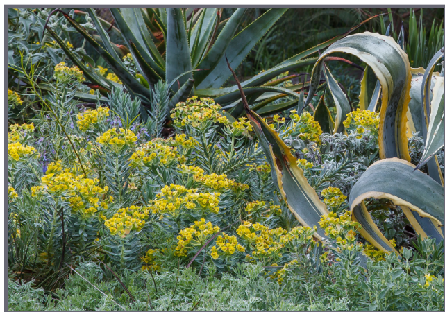
Yellow Spurge Euphorbia rigida

Euphorbia myrsinites (Yellow Spurge), perennial, 6 inches to 1 foot tall and 1 foot to 18 inches wide, with oval, blue-green, triangular leaves densely and symmetrically arranged around trailing stems. Showy yellow bracts surrounding small, greenish yellow flowers in late winter or early spring take on red tones in summer. Native from southeastern Europe to central Asia. White sap may be irritating to skin and eyes. Self-sows prolifically. Considered a noxious weed in Washington, Oregon, and Colorado. Sun to part shade, most soils.